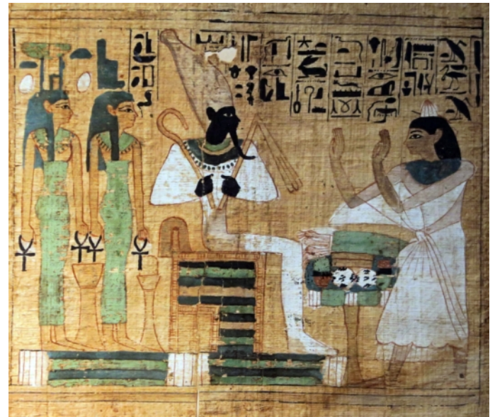
Fig. 1a & b. The opening vignettes, which are quite similar, of the Book of the Dead and Amduat papyri of Bak-en-Mut A (Cairo Museum – S.R.IV.982 = JE 95880 = CG 40023 and S.R. VII.10231).