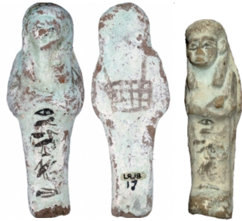
Fig. 1. Examples of shabtis for Bak-en-Mut B. Cambridge (LR.18) and Paris (MdL 20209).